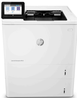
HP LaserJet Enterprise M612x