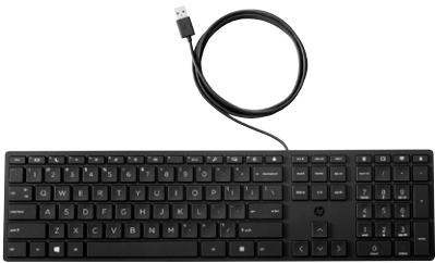
HP Wired Desktop 320K Keyboard