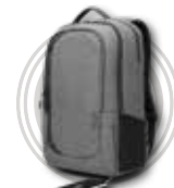
Lenovo 17" Laptop Casual Backpack B730