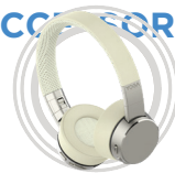
Lenovo Yoga Active Noise-cancellation Headphones