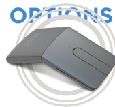
Lenovo Yoga Mouse with Laser Presenter