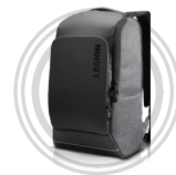
Lenovo Legion 15.6" Recon Gaming Backpack