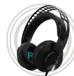
Lenovo Legion H300 Stereo Gaming Headset