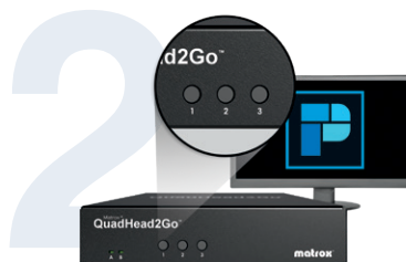
Configure using on-device buttons or the Matrox PowerWall software