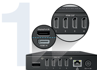
Connect using DP 1.2 or HDMI input and 4 HDMI outputs