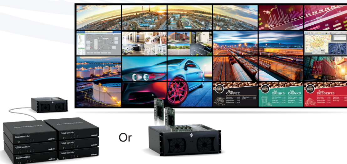
Rotate and position outputs independently from one another