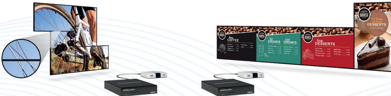
Fine-tune bezels for seamless image displays