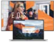
Connect for TEOS license TEC-SC100