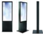
Totems TOT-XXX80H-IR10 TOT-XXX80H-CA10