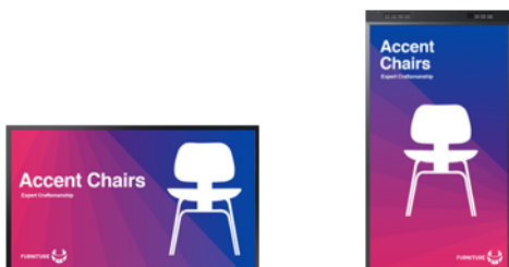
OMN series single-sided display operates in both portrait and landscape. OMN-D series dual-sided display operates in portrait mode only.

The Samsung OMN/OMN-D series was designed to do one thing: engage customers. Exceptionally bright and colorful, sidewalk traffic can't walk by without noticing your messages. The OMN single display features 4000 nits brightness, for impact on the brightest days. Its sleek, slim design will look beautiful hanging in your windows. The OMN-D series features a double-sided display. The window-facing side's 3000-nit brightness helps maintain picture integrity regardless of sunlight, while the in-store side features 1000 nits to deliver information clearly. And you can install one OMN-D series display instead of two typical displays, saving you space and installation costs while increasing your appeal, inside and out.