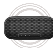
Ultraportable Bluetooth® Speaker

* Example of Lenovo Yoga Duet catalogue naming convention