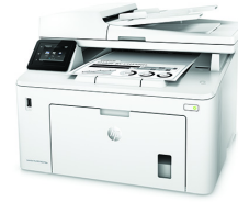
HP LaserJet Pro MFP M227fdw