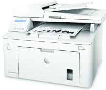
HP LaserJet Pro MFP M227sdn

Get more pages, performance, and protection 1 from an HP LaserJet Pro MFP powered by JetIntelligence Toner cartridges. Set a faster pace for your business: print two-sided documents, plus scan, copy, fax, and manage to help maximise efficiency.