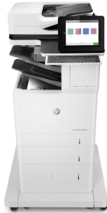
HP LaserJet Enterprise Flow MFP M636z

This HP LaserJet MFP with JetIntelligence combines exceptional performance and energy efficiency with professional-quality documents right when you need them – all while protecting your network from attacks with the industry's deepest security. 1