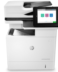
HP LaserJet Enterprise MFP M636fh

This printer is intended to work only with cartridges that have a new or reused HP chip, and it uses dynamic security measures to block cartridges using a non-HP chip. Periodic firmware updates will maintain the effectiveness of these measures and block cartridges that previously worked. A reused HP chip enables the use of reused, remanufactured, and refilled cartridges. More at: http://www.hp.com/learn/ds