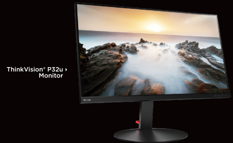
ThinkVision® P32u ▶ Monitor