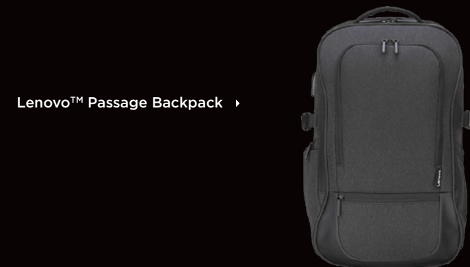
Lenovo™ Passage Backpack ▶