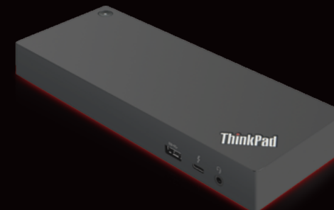
◀ ThinkPad® Thunderbolt™ Workstation Dock