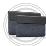
Lenovo Yoga Sleeves (14" and 15")

* Example of Lenovo catalogue naming convention