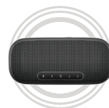
Lenovo 700 Ultraportable Bluetooth® Speaker

* Example of Lenovo catalogue naming convention