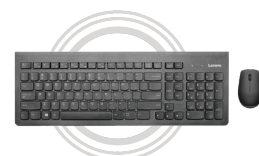
Lenovo 500 Wireless Combo Keyboard & Mouse