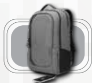
Lenovo 17" Laptop Casual Backpack B730