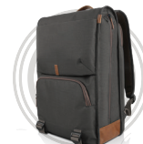
Lenovo 15.6" Laptop Urban Backpack B810