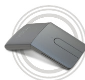
Lenovo Yoga Mouse with Laser Presenter