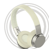
Lenovo Yoga Active Noise-cancellation Headphones