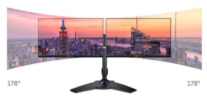
Wide Viewing Angle