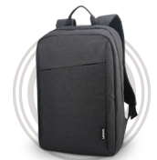
Lenovo 15.6" Laptop Casual Backpack B210