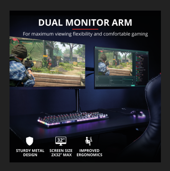
PRODUCT PICTORIAL 1