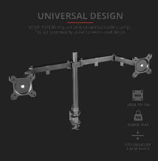
PRODUCT PICTORIAL 2