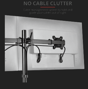
PRODUCT PICTORIAL 3