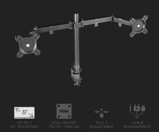
PRODUCT ESHOT 1