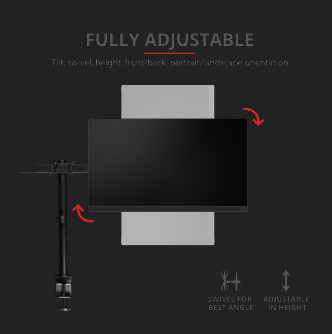
PRODUCT PICTORIAL 4