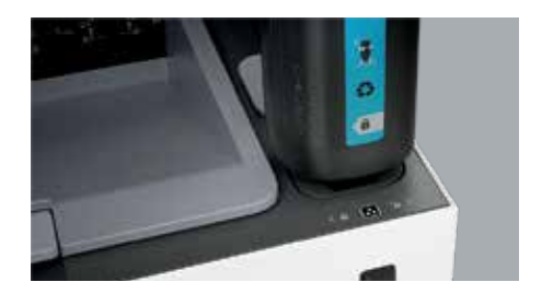
Uses the HP Black Original Neverstop Laser Toner Reload Kit<sup>4</sup>