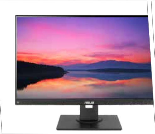
ASUS 27" Business Monitor (BE279CLB)