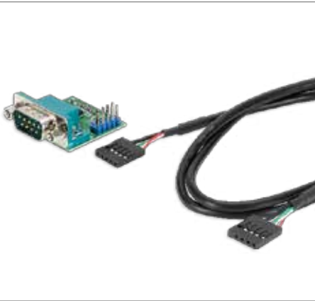
ASUS Serial Port Extension Card