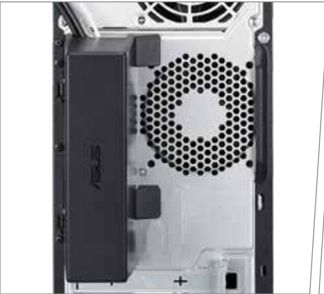
ASUS Back I/O Protector