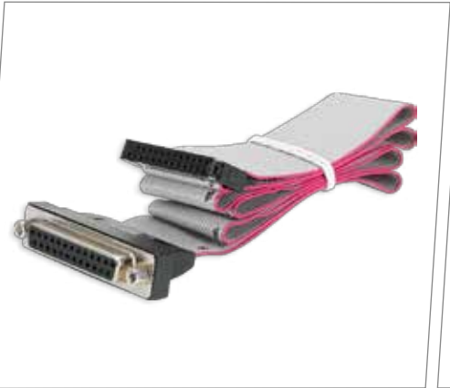
ASUS Parallel Port Cable