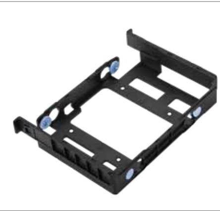
HDD Tool-less tray