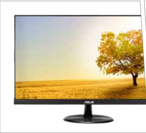
Asus 27" Eye Care Monitor (VP279N)