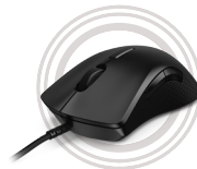
Lenovo Legion M300 RGB Gaming Mouse