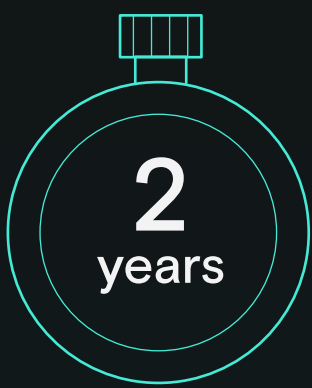
of product development

Creating a true wireless and lag-free in-ear experience engineered for gaming!