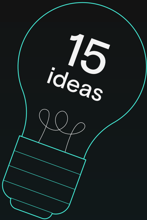
to initially explore