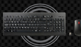
Lenovo 510 Wireless Combo Keyboard & Mouse

* Example of Lenovo IdeaCentre AIO catalogue naming convention