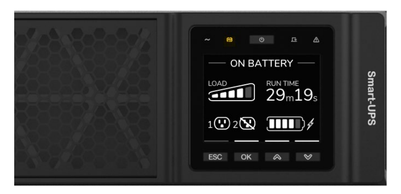
Red: indication of UPS alarm that requires immediate attention Amber: indication of condition that requires attention