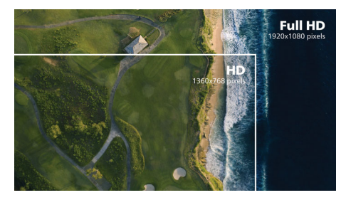
Picture quality matters. Regular displays deliver quality, but you expect more. This display

features enhanced Full HD 1920 \times 1080 resolution. With Full HD for crisp detail paired with high brightness, incredible contrast and realistic colours, expect a true-to-life picture.