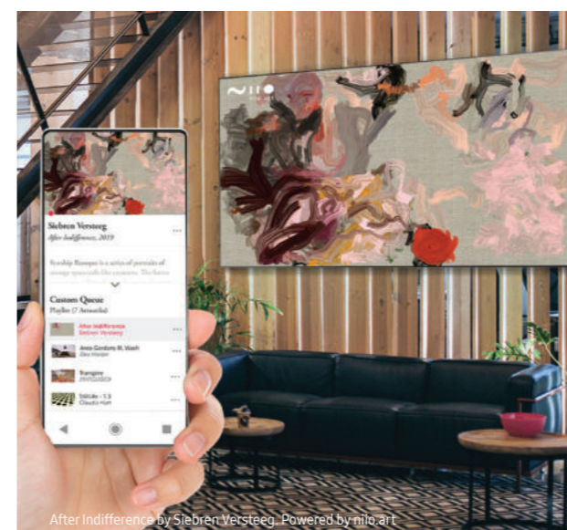
After Indifference by Siebren Versteeg. Powered by nio.art

From $750 / Month / Display Unique commissions from $18,000 / Artwork / Year