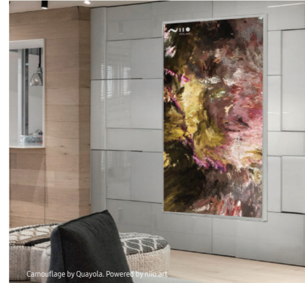
Camouflage by Quayola. Powered by nio.art