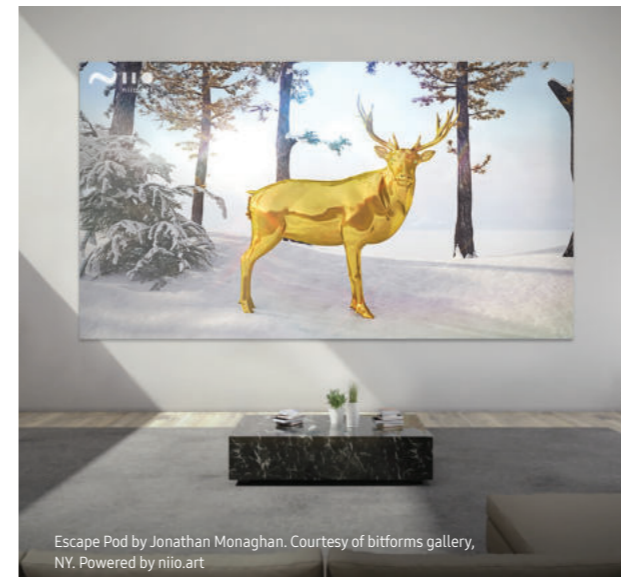
Escape Pod by Jonathan Monaghan. Powered by nio.art

From $99 / Month / Display (Public space) From $25 / Month / Display (Meeting room) From $2-10 / Month / Display (Hotel room)