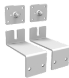
2 galvanized wall mounting brackets