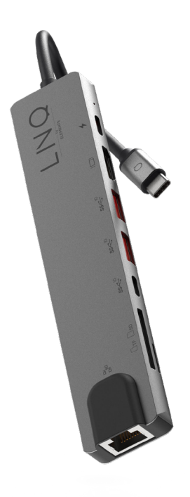
8 in 1 Pro Edition Model #: LQ48010