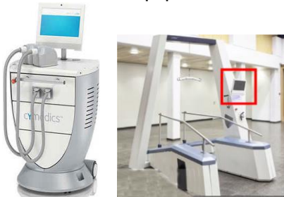
Device Control e.g. for health services or fitness equipment