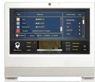
POS Radio Playing advertising and music