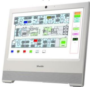
Call System e.g. for nurses (hospital) or security personnel