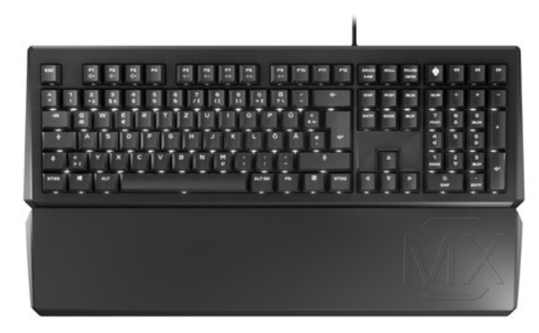
Models may vary from the image shown