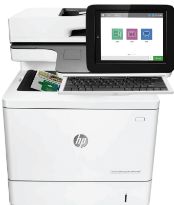
HP Color LaserJet Managed Flow MFP E57540c