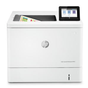
HP Color LaserJet Enterprise M555dn

HP's mid-level Enterprise-class color printer with speeds up to 38 ppm<sup>8</sup> and strongest security.<sup>2</sup>