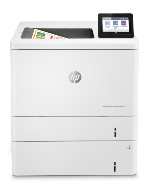
HP Color LaserJet Enterprise M555x