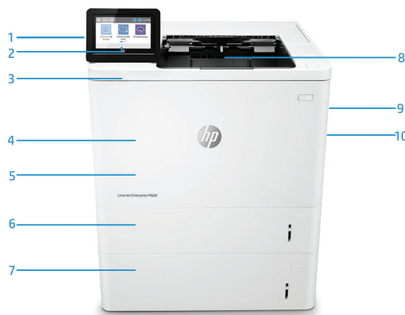
HP LaserJet Enterprise M609x