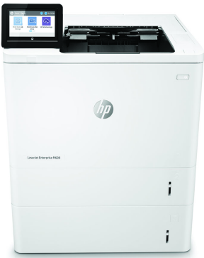
HP LaserJet Enterprise M609x