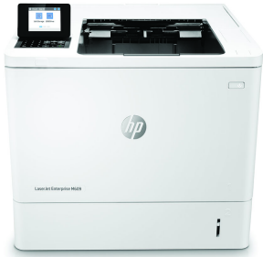
HP LaserJet Enterprise M609dn

This HP LaserJet Printer with JetIntelligence combines exceptional performance and energy efficiency with professional-quality documents right when you need them—all while protecting your network from attacks with the industry's deepest security. 1