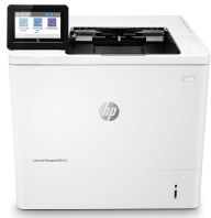
HP LaserJet Managed E60175dn

Dynamic security enabled printer. Only intended to be used with cartridges using an HP original chip. Cartridges using a non-HP chip may not work, and those that work today may not work in the future. http://www.hp.com/go/learnaboutsupplies