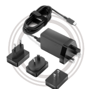
Lenovo 65W USB-C AC Travel Adapter

* Example of Lenovo catalogue naming convention