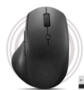
Lenovo 600 Bluetooth® Silent Mouse