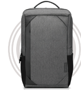
Lenovo 15.6" Laptop Urban Backpack B530