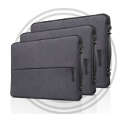
Lenovo Urban Sleeve Case