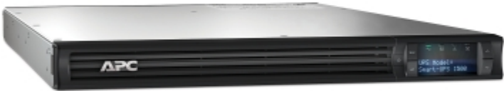
Image of product / Alternate images