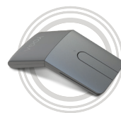
Lenovo Yoga Mouse with Laser Presenter