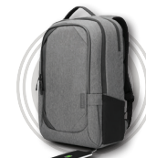
Lenovo 17" Laptop Casual Backpack B730