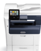
Xerox® VersaLink B405 Multifunction Printer