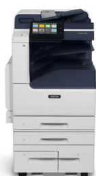
Xerox® VersaLink C7120/C7125/ C7130 Colour Multifunction Printer