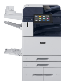
Xerox® AltaLink B8145/B8155/ B8170 Multifunction Printer

To learn more about Xerox® ConnectKey Technology, go to www.connectkey.co.uk .