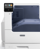
Xerox® VersaLink C7000 Colour Printer