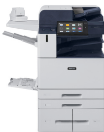
Xerox® AltaLink® C8130/C8135/ C8145/C8155/ C8170 Colour Multifunction Printer