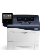
Xerox® VersaLink® C400 Colour Printer