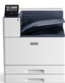
Xerox® VersaLink C8000 Colour Printer