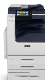
Xerox® VersaLink B7125/B7130/ B7135 Multifunction Printer