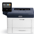
Xerox® VersaLink B400 Printer