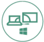
Extended Display Casting