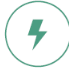
High Security Encryption