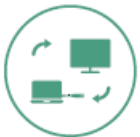
Intuitive Remote Control