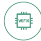
Wi-Fi 6 Chip