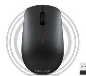
Lenovo 400 Wireless Mouse