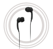
Lenovo 100 In-Ear Headphone