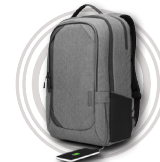
Lenovo 17" Laptop Casual Backpack B730