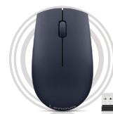
Lenovo 520 Wireless Mouse