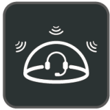
Acoustic Shield Technology