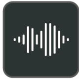
Optimal Audio Experience