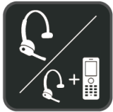
Stand-Alone and Paired Mode